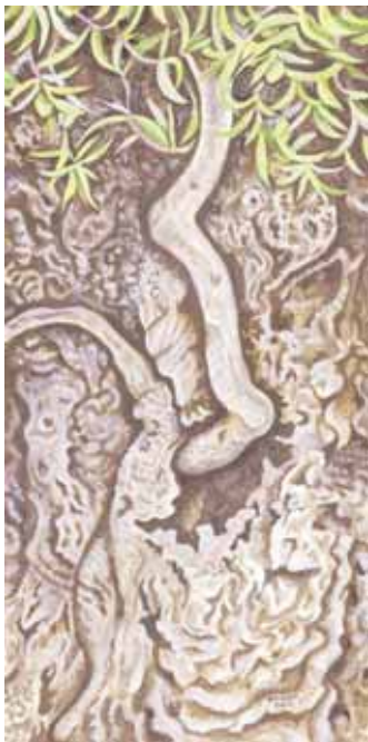
Resurrection (Ancient Olive, Garden of Gethsemane) acrylic on canvas - 10"x20" $350