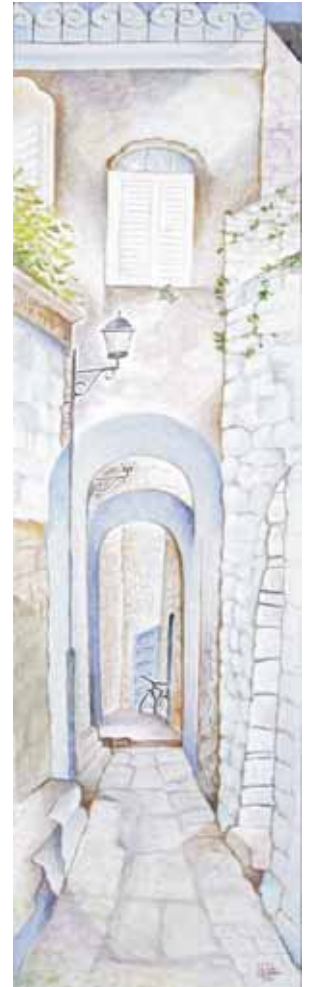
Blue Alley, Tzfat acrylic on canvas 12"x47" - $550

8.5"x11" POSTERS ARE AVAILABLE! $12 each inquire in WJC office or email durga@durgabernhard.com