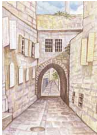
Jerusalem Alley acrylic on canvas - 9"x12" $175