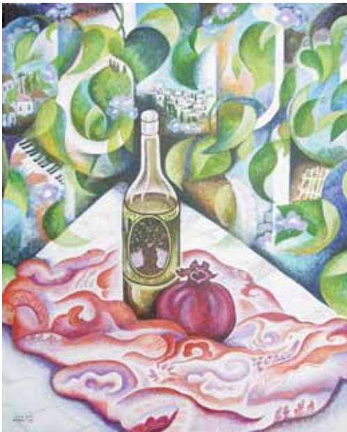
Still Life, Jerusalem acrylic on canvas - 24"x30" $850