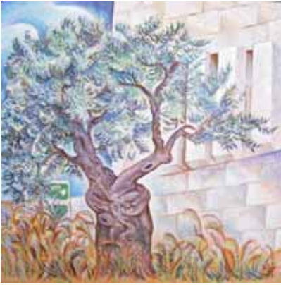
City Olive acrylic on birch wood - 20"x20" $375