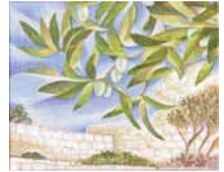
Olives in August acrylic on canvas - 10"x8" $75