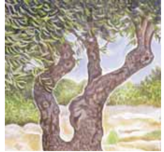
Young Olive Tree acrylic on canvas - 12"x12" $100