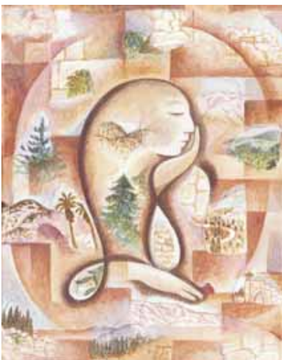
Returning from Israel acrylic & collage on canvas - 11"x14" $400

TO VIEW MORE ART BY DURGA YAEL VISIT durgabernhard.com