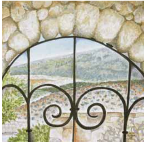
Tzfat Window (1) acrylic on canvas - 20"x20" $750