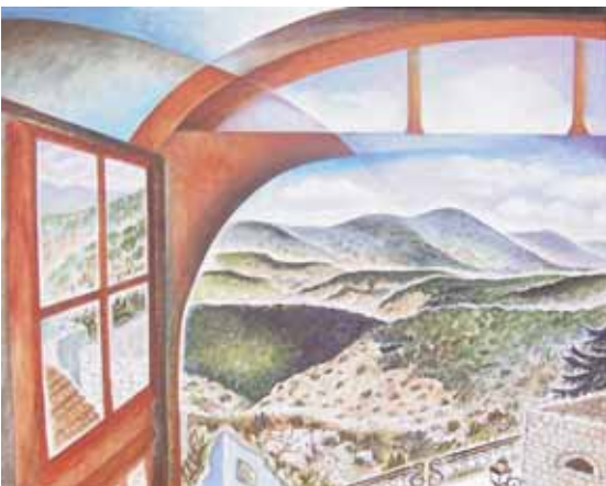
Tzfat Window (2) acrylic on canvas - 30"x24" $400

8.5"x11" POSTERS ARE AVAILABLE! $12 each inquire in WJC office or email durga@durgabernhard.com